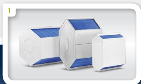
Residential ventilation components